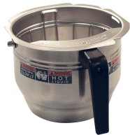
FUNNEL AY,W/DECAL GRT "C"7.62