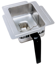
FUNNEL ASSY, SST-PP BLK HDL