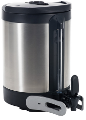
SH SERVER, 1.5G/5.7L INF SERIES