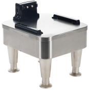
1SH STAND, CE 220-240V INF SERIES