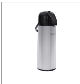
AIRPOT, 2.5L GL PB SINGLE PK