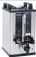
SH SERVER, 1.5G/5.7L 197F NO FL ADJ TMR