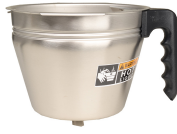
FUNNEL ASSY, W/ INSERTS SMTF