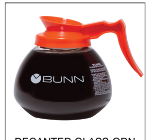
DECANTER,GLASS-ORN 12C 24/CS