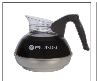
EASY POUR®,(BLK) 24/