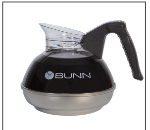
EASY POUR®, (BLK) 6/CS