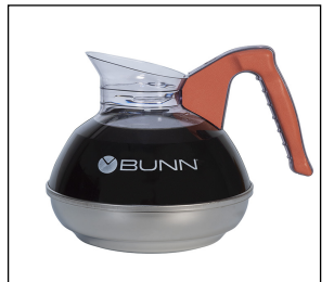
EASY POUR®,(ORN) 3/