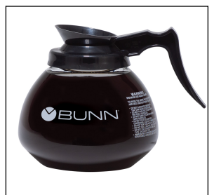
DECANTER,GLASS-BLK 12C 3/CS