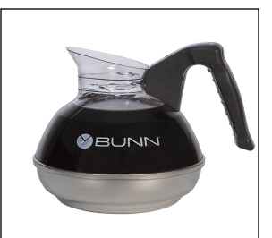
EASY POUR®,(BLK) 1/CS