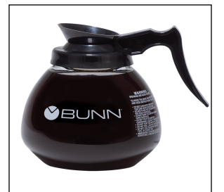
DECANTER,GLASS-BLK 12C 24/CS