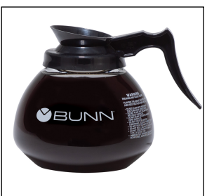
DECANTER,GLASS-BLK 12CUP 1PK