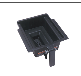
FUNNEL W/DECAL,PPK NAR BLK(LG)